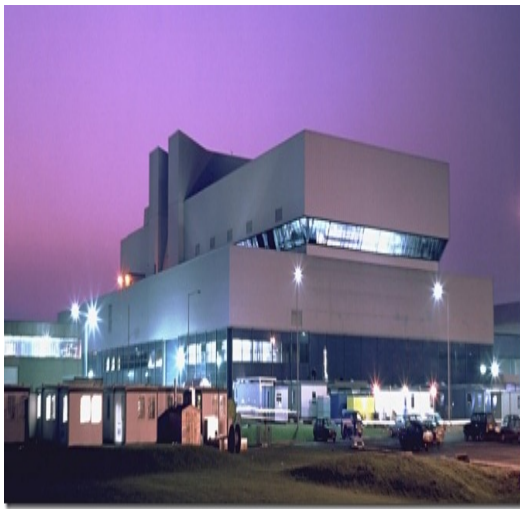
JET facility at Culham